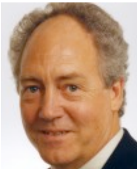
Dr Patrick Moore

Why would Australian politicians reject GE canola when it has been the bread-winning crop for most Canadian prairie farmers since 1998? I believe it is from fear and mis-information fed to the average voter that the politicians are following. The hysteria being whipped up by anti-GE people is from a motive that I can not comprehend. I can comprehend Greenpeace's stance - they need an issue to keep themselves in the spot-light and keep their funding happening.