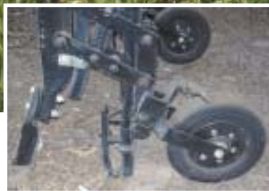
No-tillage means profitability and sustainability