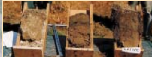
Above: Fallowed degraded soil on left, 20 years no-till in the middle, native prairie on right.

Wouldn't this benefit YOU... ..and YOUR farm?