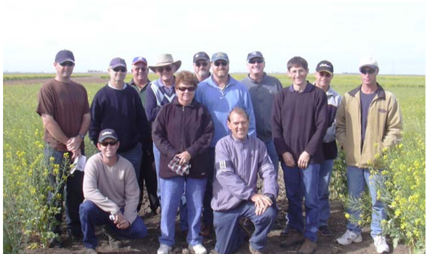
Right: In October 2004, eleven WA farmers inspected a Bayer GM canola trial at Horsham. We were impressed, there was perhaps a doubling in yield with their GM.