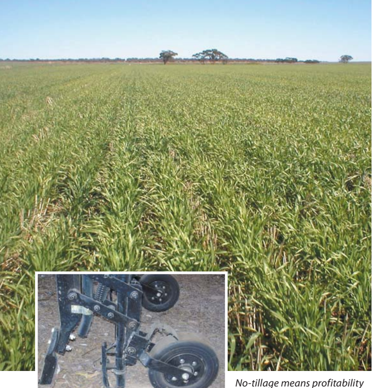
No-tillage means profitability and sustainability

Tear off and return the Reply Slip (over) with payment, to: